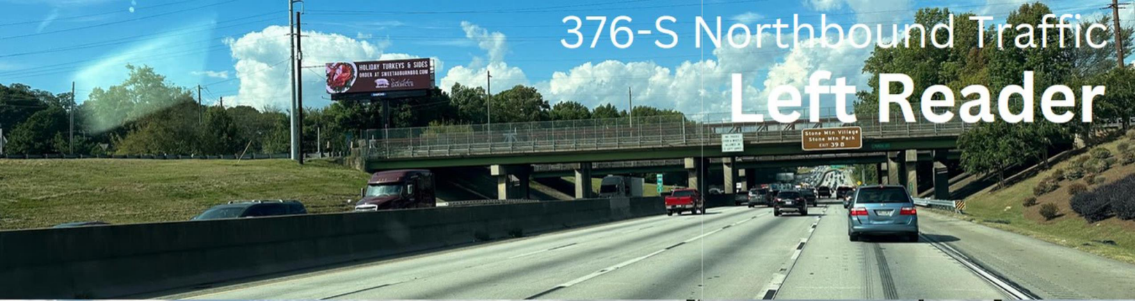
376-S Northbound Traffic Left Reader